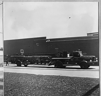
TRUCK - 60 5559 S. Narragansette (GARFIELD RGE) 1955 FWD 85 FT WD