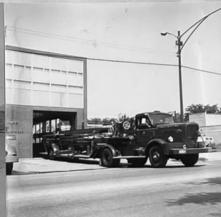
TRUCK - 59 8022 S. Kedzie Ave (SCOTSDALE) 1949 FWD 85 FT WD