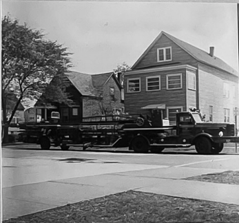
TRUCK - 61 10458 Hoxie Ave (CALUMET HARBOR) 1955 FWD 85 FT WD