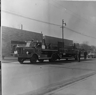
TRUCK - 58 4913 Belmont Avenue (BELPARK) 1955 FWD 85 FT WD