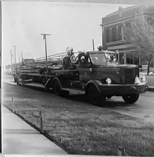
TRUCK - 53 2325 N. Natchez Ave (MONTCLARE) 1954 FWD 85 FT WD