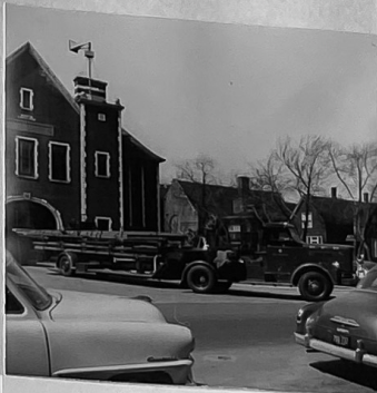
TRUCK - 51 6204 S. Green St (ENGLEWOOD) 1949 FWD 85 FT WD