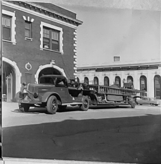
TRUCK - 52 3004 W. 42 ND St (BRIGHTON PARK) 1942 MACK tot-1928 SEAGRAVE 85 FT