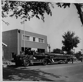
TRUCK - 56 3947 Petersen Ave (SAUGANASH) 1942 MACK-tot-1925 CFD CST