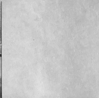
TRUCK - 54 5837 S. Central Ave (MIDWAY AIRPORT) 1950 AVLBLE tot-1928 SEAGRAVE 75 FT