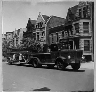
TRUCK - 55 6028 Avondale Ave (NORWOOD PARK) 1955 FWD 85 FT WD