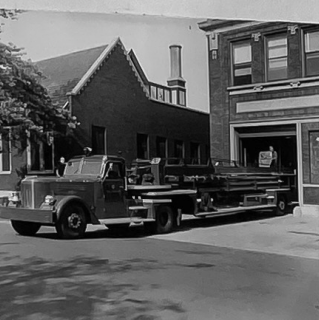
TRUCK - 49 7313 Kingston Ave (HIGHLANDS) 1954 Firsch 85 FT WD