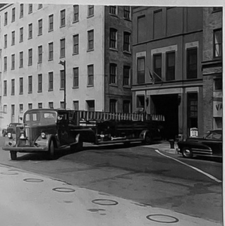
TRUCK - 44 2740 Sheffield Ave (LAKEVIEW) 1938 Firsch 100 FT M