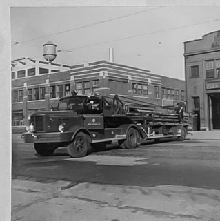
TRUCK - 41 6041 S. Western Ave (GAGE PARK) 1954 FWD 85 FT WD