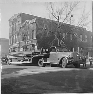
TRUCK - 31 1401 S. Michigan Blvd (BURNHAM PARK) 1944 Firsch 85 FT WD