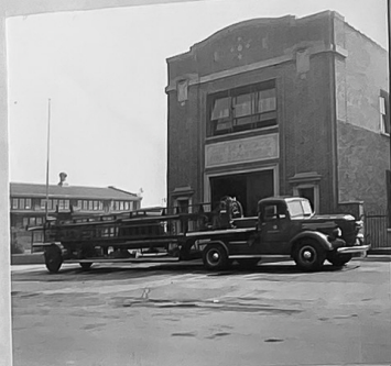
TRUCK - 35 1713 N. Springfield Ave (CRAGIN) 1942 MACK tct-1929 CFD 85 FT