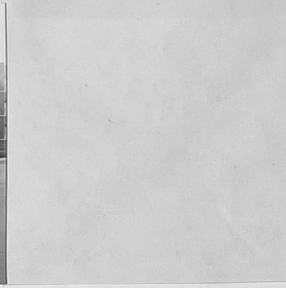
TRUCK - 37 1409 E. 62 ND FL (WOODLAWN) 1942 MACK tct-1928 CFD CST