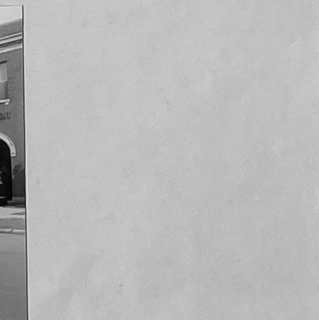
TRUCK - 47 5714 Ridge Avenue (ROGERS PARK) 1955 FWD 85 FT WD