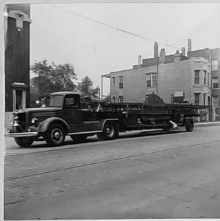
TRUCK - 36 722 N. Kedzie Avenue (GARFIELD PK) 1942 MACK tct-1928 CFD 85 FT