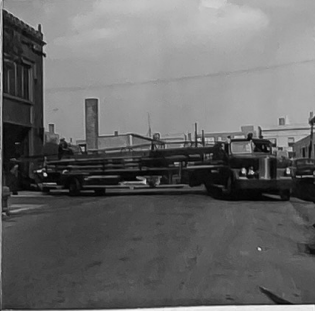
TRUCK - 27 34 E. 114 TH St (KENSINGTON) 1954 Firsch 85 FT