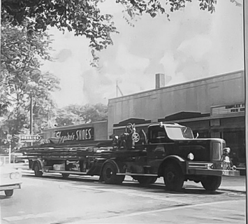
TRUCK - 40 1700 W. 95 TH St (BEVERLY) 1949 FWD 85 FT WD