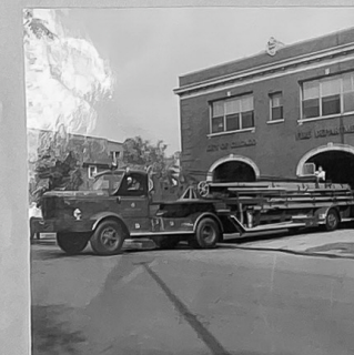
TRUCK - 46 4664 Fulton St (COLUMBUS PARK) 1954 FWD 85 FT WD