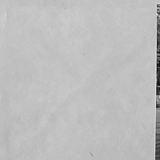
TRUCK - 48 2113 S. Hamlin Ave (MORTON PARK) 1946 Firsch 85 FT WD