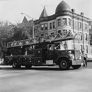
TRUCK - 39 25 S. Laflin Avenue (UNION PARK) 1961 MACK-MAGIRUS 146 FT M