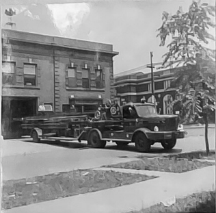
TRUCK - 26 4002 Wilcox Ave (GARFIELD PARK) 1954 FWD 85 FT