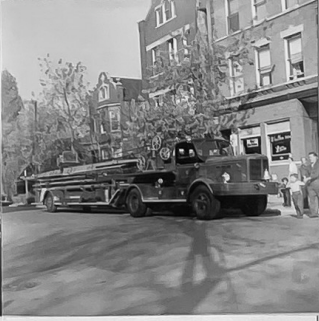
TRUCK - 32 2360 S. Whipple St (MARSHALL SQUARE) 1954 FWD 85 FT WD