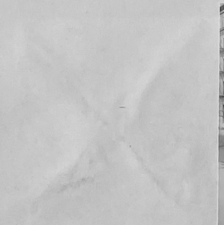
TRUCK - 43 2322 Foster Ave (BOWMANVILLE) 1942 MACK tct-1915 SEAGRAVE 85 FT