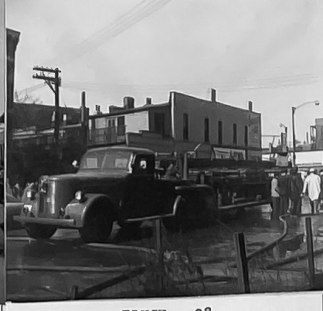
TRUCK - 28 1623 N. Damen Ave (WICKER PARK) 1946 Firsch 85 FT WD