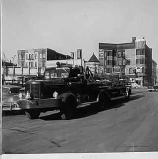
TRUCK - 33 4459 S. Marshfield Ave (NEW CITY) 1954 FWD 85 FT WD