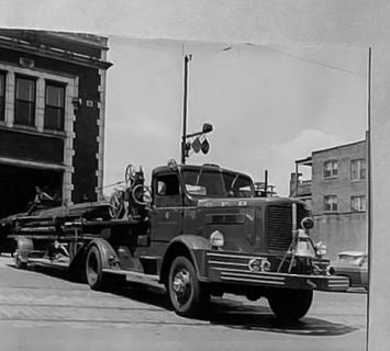
TRUCK - 50 8120 S. Ashland Avenue (AUBURN PARK) 1949 FWD 85 FT WD