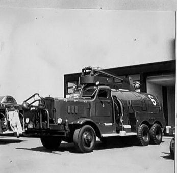
CARDUX No. 2 1944 Sterling-6000# CO 2 500 Gals pre-mixed FOAM 2-beds 100 EA for FOAM 1 1/2"