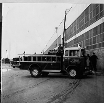
BOOSTER CO. No. 1 1960 Willies Jeep 600# at tip-J.BEAN