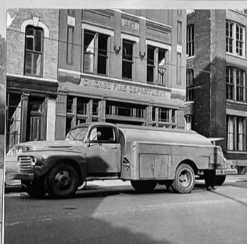
RESV-GAS & OIL UNIT 1950 FORD TANKER 1950 FORD