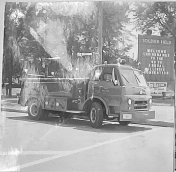
HIGH PRESSURE No. 1 1956 International (E 21)