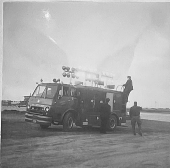
LITE UNIT No. 1 1956 International