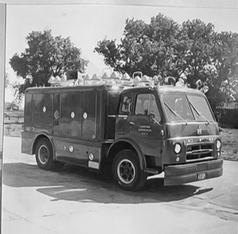
LITE UNIT No. 2 1956 International