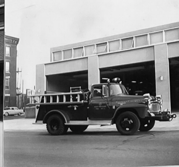
PRESSURE FOG No. 3 1962 International 600# at tip-DARLEY (E 21)