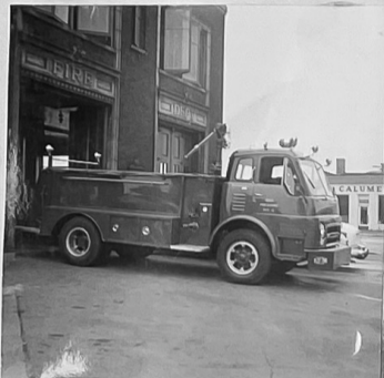
HIGH PRESSURE No. 6 1956 International (E 21)