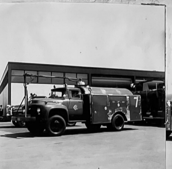
CARDUX No. 3 1955 Ford - 4000# CO 2 2-100 Ft Reels 650# PSI EA Beem packs - 1250# EA