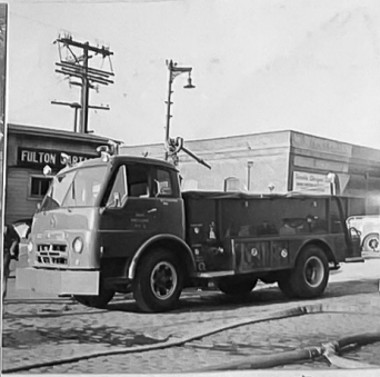
HIGH PRESSURE No. 2 1956 International (E 21)