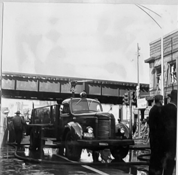
HIGH PRESSURE No. 7 1948 MACK Special Unit INTERNATIONAL