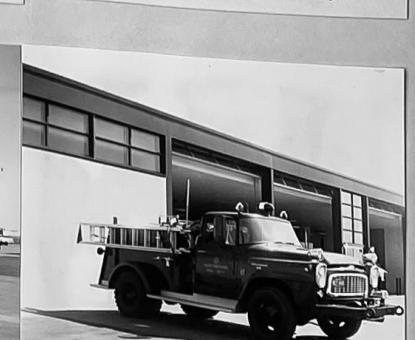
PRESSURE FOG No. 2 1962 International