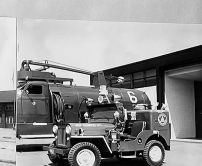
JEEP CHEMICAL No. 1 Willies Jeep(O'HARE) CD