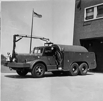
CARDUX UNIT No. 1 (MIDWAY AIRPORT) 1949 AUTOCAR Continental Motor 4500 lbs "snow" under 300# CO 2 Pressure 230 Gals of FOAM