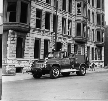
PRESSURE FOG No. 4 1962 INTERNATIONAL