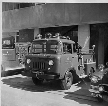
JEEP PRESSURE No. 1 1958 Willies Jeep