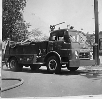
HIGH PRESSURE No. 3 1956 International