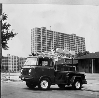
LITE UNIT No. 4 1961 Willies Jeep