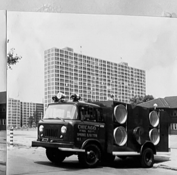
SMOKE EJECTOR No. 1 1961 International