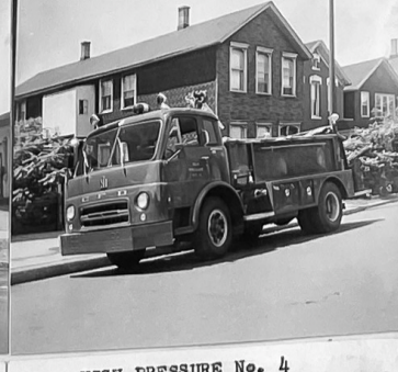
HIGH PRESSURE No. 4 1956 International