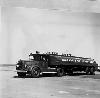
AIRPORT TANKER No. 1 1946 MACK tract-5500 Gals Wtr 800 Ft 2 1/2" - 400 Ft 1 1/2" Also Port 500 GPM pump