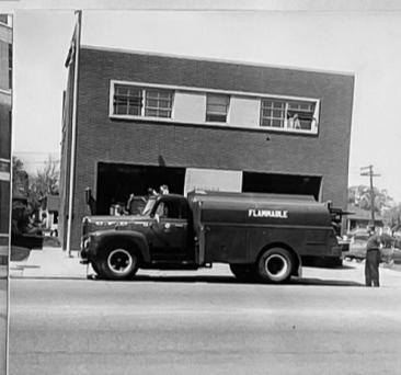
GAS & OIL UNIT No. 1 1959 International