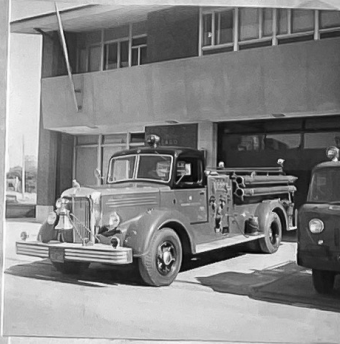
ENG 4 1244 NO HALSTED ST (GOOSE IS) 1949 MACK 1000 GPM