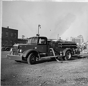
ENG 11 10 E. HUBBARD ST (EAST CHGO) 1954 MACK 1000 GPM