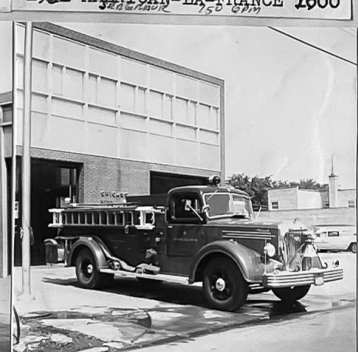
ENG 15 8026 SO KEDZIE (SCOTSDALE) 1949 MACK 1000 GPM