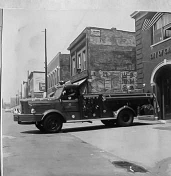
ENG 8 212 W. CERMAK RD (CHINATOWN) 1953 FWD 1000 GPM