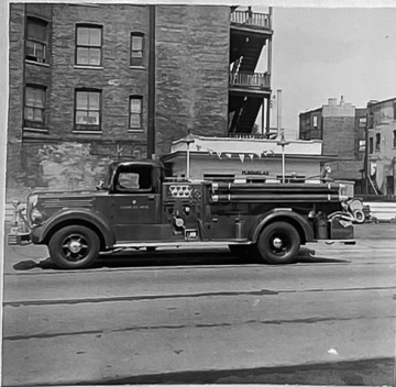
ENG 16 23 EAST 31st St (ARMOUR PARK) 1949 MACK 1000 GPM