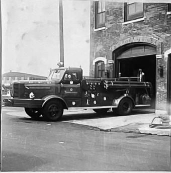
ENG 2 DISBANDED NOV 16, 1963 2421 LOWE AVE (BRIDGEVIEW) 1953 FWD 1000 GPM