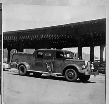
ENG 5 324 SO DESPLAINES STREET 1948 MACK 1000 GPM