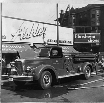
ENG 12 1641 W. LAKE ST (UNION PK) 1949 MACK 1000 GPM