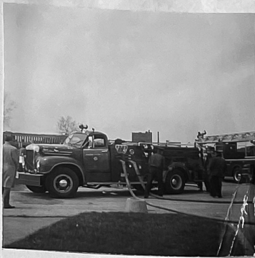
ENG 1 419 SO WELLS ST (LOOP) 1956 MACK 1000 GPM