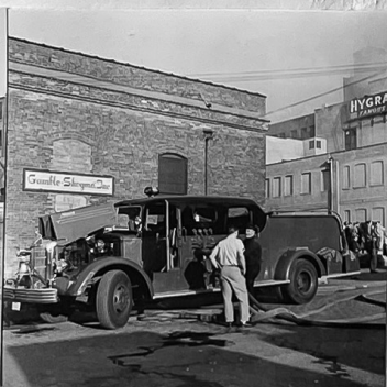
ENG 17 558 W. LAKE ST (FULTON MARKET) 1948 MACK 1000 GPM