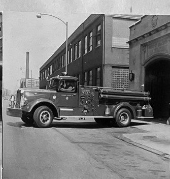
ENG 9 2341 SO WABASH AVE (GROVELAND) 1954 MACK 1000 GPM