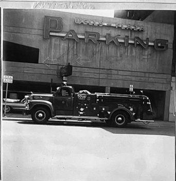
ENG 13 209 NO DEARBORN ST (LOOP) 1956 MACK 1000 GPM