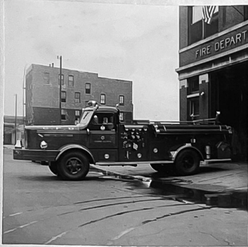
ENG 6 DISBANDED JUNE 16, 1963 559 MAXWELL STREET (STANFORD) 1953 FWD 1000 GPM