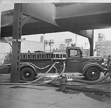
ENG 21 419 S. Wells St (LOOP) 1951 MACK 1000 GPM