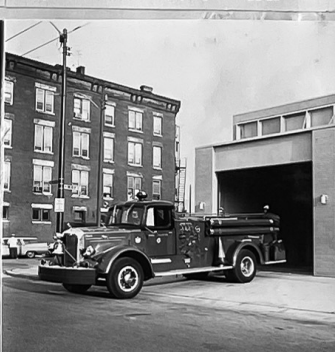
ENG 14 1129 509 W. CHICAGO AVENUE 1954 MACK 1000 GPM