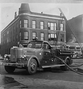
ENG 19 3419 CALUMET AV (LK MEADOWS) 1952 PIRSCH 1000 GPM