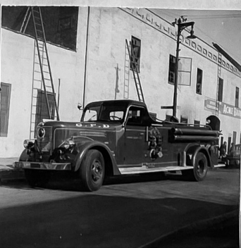
ENG 24 2447 Warren Blvd (CONGRESS P) 1950 PIRSCH 1000 GPM