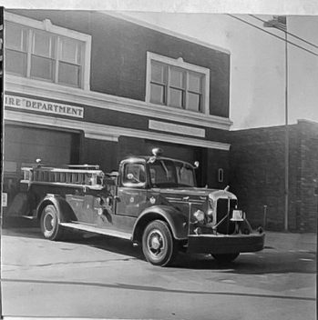
ENG 7 4911 W. BELMONT (BRYANT PARK) 1954 MACK 1000 GPM