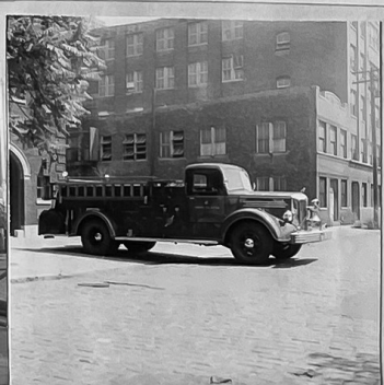
ENG 20 1318 Concord Pl (BRIARGATE) 1949 MACK 1000 GPM