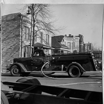
ENG 18 1123 ROOSEVELT RD (SO WATER MK) 1952 PIRSCH 1000 GPM