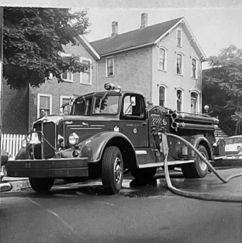
ENG 22 522 Webster Ave (LINCOLN PK) 1954 MACK 1000 GPM