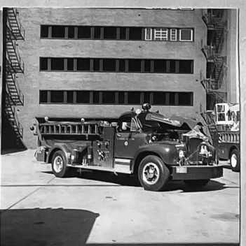
ENG 25 541 W. Taylor St (ACADEMY) 1975 Canalport Ave (CANALPT) 1949 MACK 1000 GPM