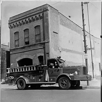
ENG 23 1702 W. 21st Pl (PILSEN) 1953 FWD 1000 GPM