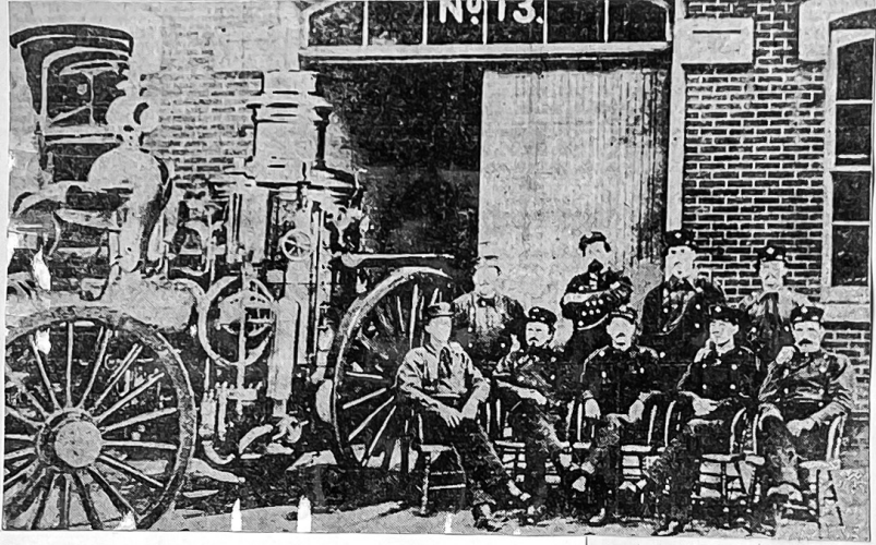
Engine 13 19 Dearborn St 1888 HJMcGinnis