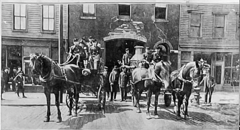
THE FAITHFUL HORSES DREW THE FIRE APPARATUS FROM THE OLD QUARTERS AT 636 BLUE ISLAND AVE FOR THE LAST TIME